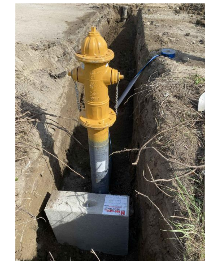
PLACING A NEW FIRE HYDRANT ON ISENHART ROAD