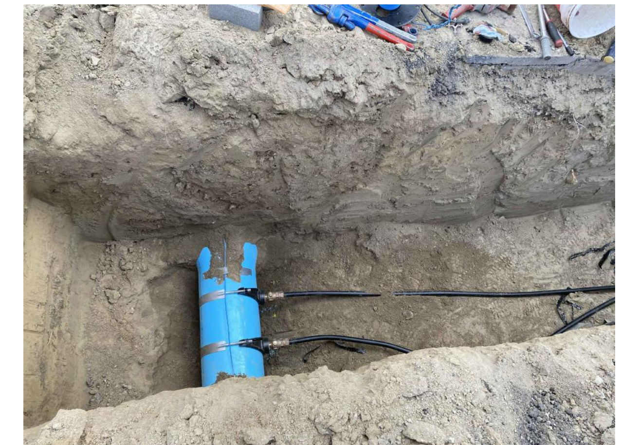
INSTALLING NEW WATER SERVICES ON WILLMORTH DRIVE